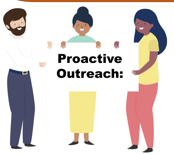
Contact fathers via community organisations, social networks, and local partnerships..